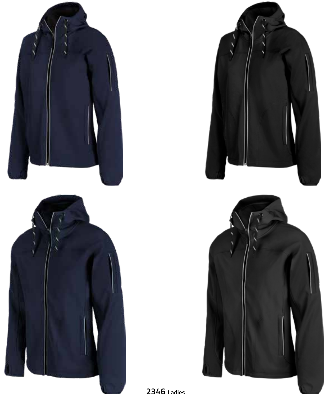
2346 Ladies 2356 Men

Trendy softshell hoodie with fancy laces, 2 outside zip pockets, sleeve pocket with earphone cable opening, inside pocket, phone pocket and thumb loops.