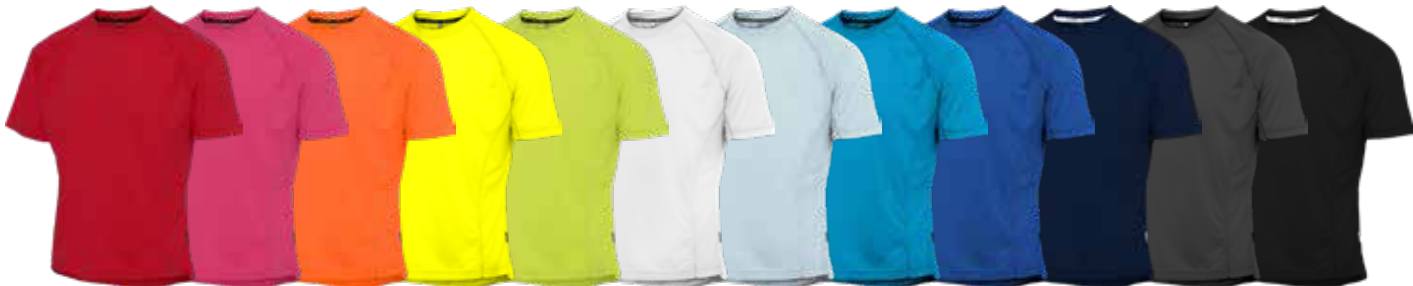
Red Magenta Orange Fl. Yellow Lime White Ice Blue Turquoise Azur Navy Grey Black