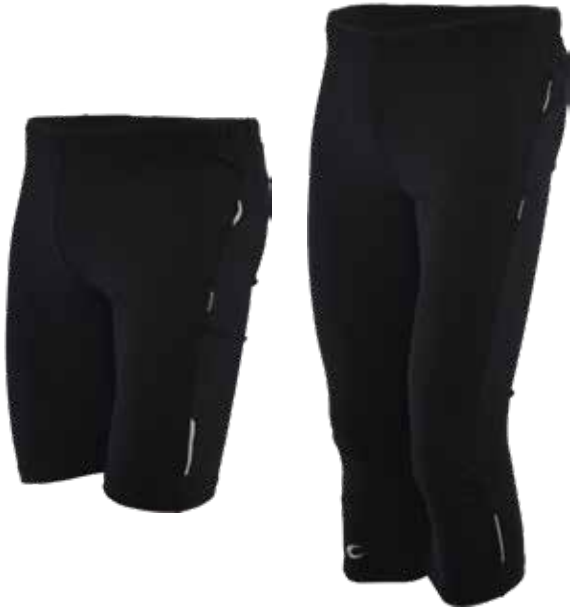
5242 SHORT TIGHTS Unisex