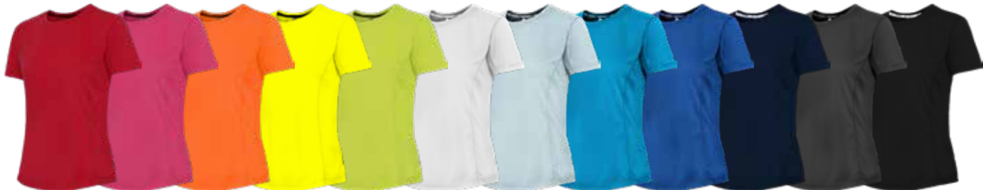
Red Magenta Orange Fl. Yellow Lime White Ice Blue Turquoise Azur Navy Grey Black